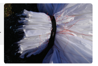
Step 3. Lay wing on its side and Strap LE...Note the glider is NOT folded in half; it is folded with a complete concertina from tip to tip. It is really important to not stress the middle cell or bend the plastic too tightly.