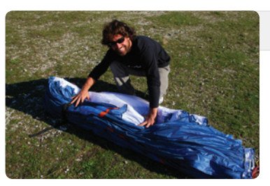
Step 5. Once the LE and rear of the wing have been sorted, turn the whole wing on its side.