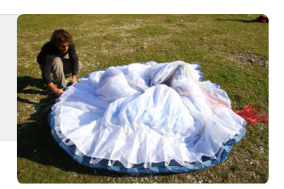
Step 2. Group LE reinforcements with the A tabs aligned, make sure the plastic reinforcements lay side by side.

Step 1 . Lay mushroomed wing on the ground. It is best to start from the mushroomed position as this reduces the dragging of the leading edge across the ground.