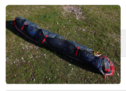
Step 9. Turn the Saucisse on its side and make the first fold just after the LE reinforcements. Do not fold the plastic reinforcements, use 3 or 4 folds around the LE.