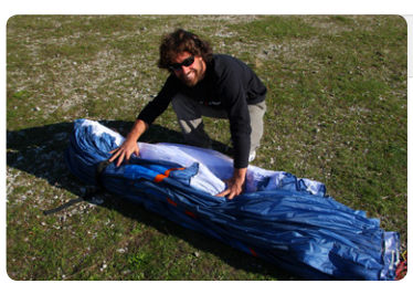
Step 5. Once the LE and rear of the wing have been sorted, turn the whole wing on its side.