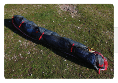
Step 9 . Turn the Saucisse on its side and make the first fold just after the LE reinforcements. Do not fold the plastic reinforcements, use 3 or 4 folds around the LE.