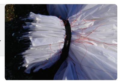
Step 3. Lay wing on its side and Strap LE...Note the glider is NOT folded in half; it is folded with a complete concertina from tip to tip. It is really important to not stress the middle cell or bend the plastic too tightly.