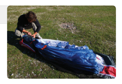
Step 8 . If using the Saucisse Pack, carefully zip it up without trapping any material.