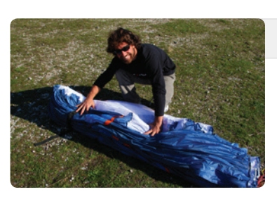
Step 5. Once the LE and rear of the wing have been sorted, turn the whole wing on its side.