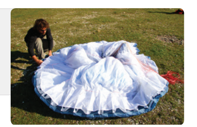
Step 2. Group LE reinforcements with the A tabs aligned, make sure the plastic reinforcements lay side by side.