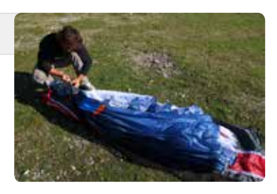
Step 8 . If using the Saucisse Pack, carefully zip it up without trapping any material.