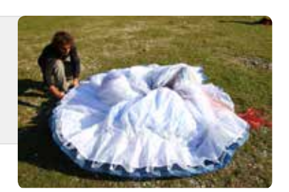
Step 2. Group LE reinforcements with the A tabs aligned, make sure the plastic reinforcements lay side by side.

Step 1. Lay mushroomed wing on the ground. It is best to start from the mushroomed position as this reduces the dragging of the leading edge across the ground.