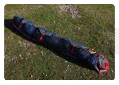
Step 9 . Turn the Saucisse on its side and make the first fold just after the LE reinforcements. Do not fold the plastic reinforcements, use 3 or 4 folds around the LE.