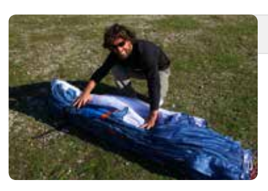
Step 5. Once the LE and rear of the wing have been sorted, turn the whole wing on its side.