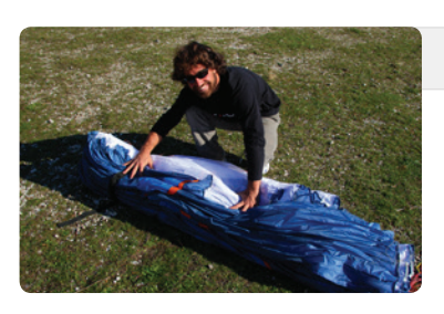
Step 5. Once the LE and rear of the wing have been sorted, turn the whole wing on its side.