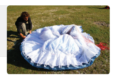
Step 2. Group LE reinforcements with the A tabs aligned, make sure the plastic reinforcements lay side by side.

Step 1. Lay mushroomed wing on the ground. It is best to start from the mushroomed position as this reduces the dragging of the leading edge across the ground.