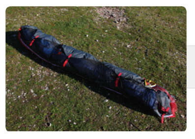
Step 9. Turn the Saucisse on its side and make the first fold just after the LE reinforcements. Do not fold the plastic reinforcements, use 3 or 4 folds around the LE.