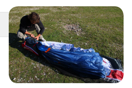
Step 8 . Turn the Saucisse on its side, lay the Folding Pillow in place and make the fold of the LE around it. Use 3 folds.