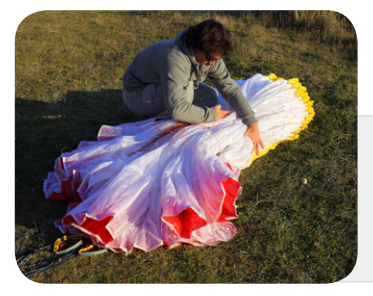
Step 3. Group together the middle and the trailing edge (TE) of the wing by sorting the concertina folds near the B and C tabs.