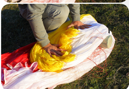
Step 5. Place the Folding Pillow below the LE - at the point of the first fold. The pillow reduces the angle of the fold and helps preserve the plastics. Next fold the TE over the LE being careful to not fold with tight angles.