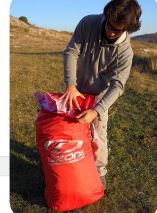
Step 6. Now place the folded wing into the stuff sack.