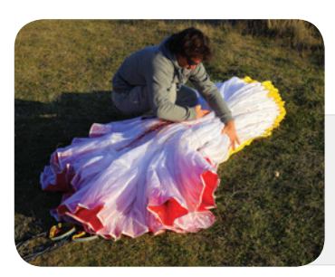
Step 3. Group together the middle and the trailing edge (TE) of the wing by sorting the concertina folds near the B and C tabs.