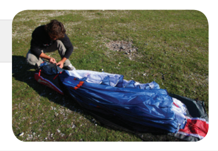
Step 8 . Turn the Saucisse on its side, lay the Folding Pillow in place and make the fold of the LE around it. Use 3 folds.