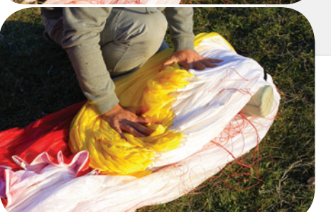
Step 5. Strap the Folding Pillow below the LE - at the point of the first fold. The pillow reduces the angle of the fold and helps preserve the plastics. Next fold the TE over the LE being careful to not fold with tight angles.